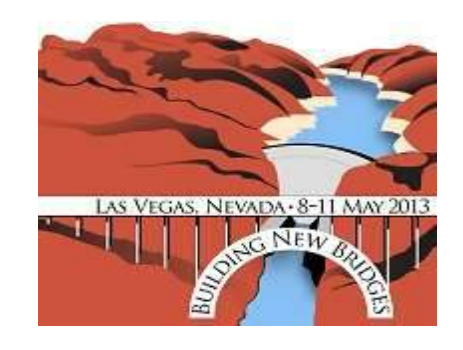
May 8-11, 2013 - Las Vegas, Nevada

Building New Bridges 2013 NGS Annual Conference National Genealogy Society